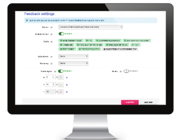
eSOFS™ - e-Sourcing ocean freight and bid administration platform