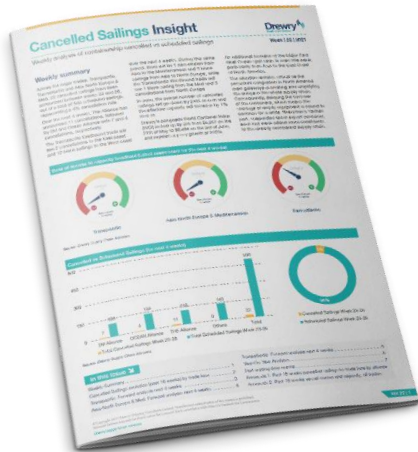
Annual subscription: $1,200 / £900

Weekly analysis of past, current and future cancelled sailings reported by the world’s major ocean container carriers and alliances