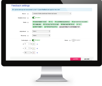
eSOFS™ - eSourcing ocean freight and bid administration platform