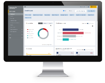
Drewry's new Container Freight Portal